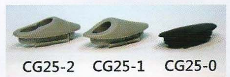
CG25-2 CG25-1 CG25-0